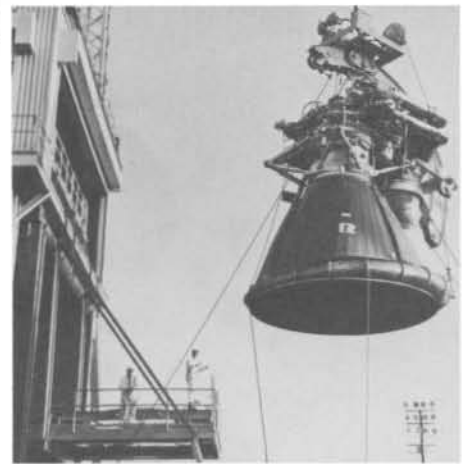
F-1 engine is placed in test stand at Marshall Center test area.

(Note: Length and burn time figures are approximate, designed to show comparison in engine size and mission.)