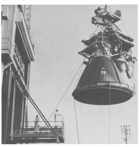
F-1 engine is placed in test stand at Marshall Center test area.

(Note: Length and burn time figures are approximate, designed to show comparison in engine size and mission.)